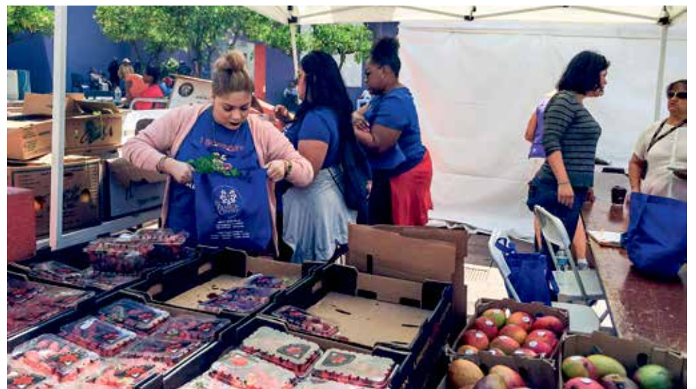
At Feeding the 5000, Republic Services volunteers created meal bags with surplus food from local food banks.

Wasting less food will help us achieve the Zero Waste LA goals. Thank you to Republic Services Los Angeles employees for being food waste warriors and working with community partners on feeding people before feeding landfills.