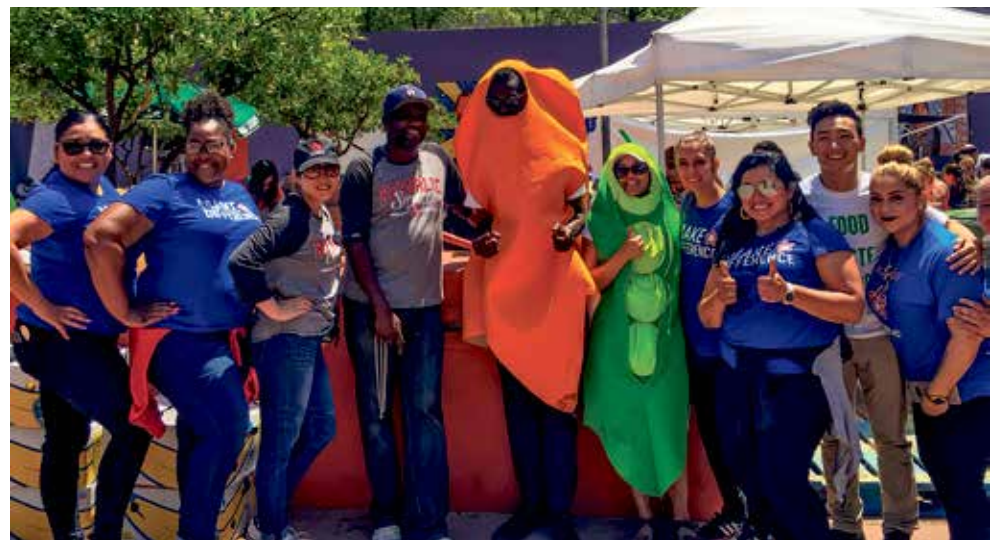
Republic Services Los Angeles employees took part in the Feeding the 5000 event in downtown Los Angeles.

Republic Services and Food Finders are partners in the Waste Not OC Coalition, whose mission is to feed the need in Orange County. The Coalition includes multiple agency partners and promotes food recovery and distribution, as well as training potential donors to handle food safely. To learn more or to get involved, visit WasteNotOC.org or call 855-700-WNOC (855-700-9662).